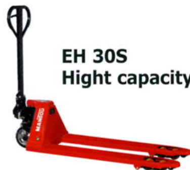
EH 30S High capacity