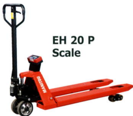
EH 20 P Scale