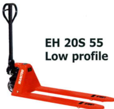
EH 20S 55 Low profile