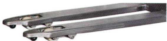
Stainless steel forks