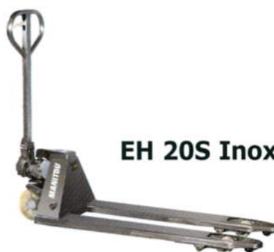
EH 20S Inox