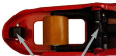
Entry and exit rollers