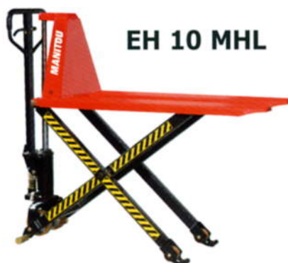
EH 10 MHL