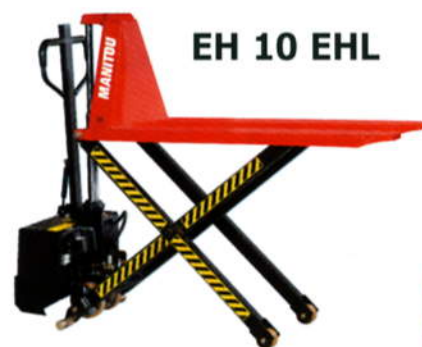
EH 10 EHL