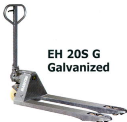
EH 20S G Galvanized